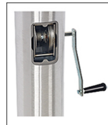
IRW - WINCH